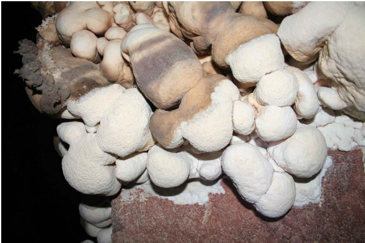
Fig. 2: Large microbial speleothem forms called “champignons” are frequently more than 30 cm in size (Cueva Charles Brewer, Chimantá).

and forms and they most of them bear signs of microbial origin (Fig. 2). Many of the speleothems remind classical stalactites and stalagmites known from limestone caves but their structure and genesis are different. Apart from variable shapes, the microbial speleothems show identical principal texture, corresponding to various stages of their evolution (Fig. 3). They consist of two principal zones: 1. laminated columnar stromatolite, consisting of non-porous compact opal, forms mostly the internal zones of the speleothems, 2. strongly porous zone formed by white chalk-like opal, represents accumulation of microbial peloids and forms mostly the outer zones of the speleothems. In some speleothems, both zones may alternate.