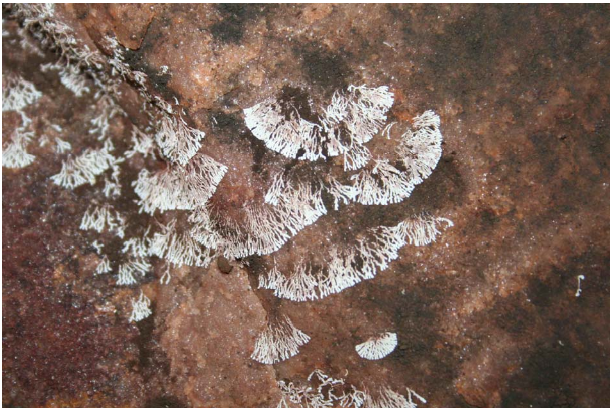
Fig. 4: Silica-encrusted shrubs forming an initial mat of Nostoc -type microbes on the quartzite substrate (Cueva Cañon Verde, Chimantá).

The reason for the size dependence between the caves and the speleothems is yet unclear. One of the possible explanations would be that the larger the cave is, the more siliceous material undergoes the dissolution/reprecipitation cycle. Larger cave corridors and galleries of the Cueva Charles Brewer have several times larger surface than other caves available for the condensed air moisture which plays the most important role in the cycle.